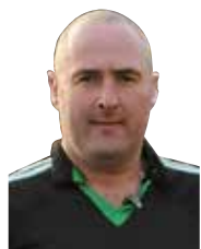
DONNELLY VAUXHALL INTERMEDIATE CHAMPIONSHIP FINAL REFEREE