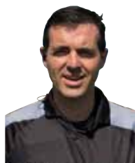
DONNELLY VAUXHALL SENIOR CHAMPIONSHIP FINAL REFEREE

Well done to the three young members of the Tyrone Young Referee's Academy to take charge of the Mini Games during today's Championship Finals.